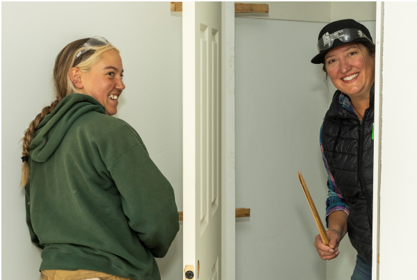
Women's Build volunteers install doors

This month, our team focused on finishes. This involved priming and painting interior walls and installing interior doors. Our team then moved onto finish carpentry such as installing baseboard, case, header, and window sills. The team will continue working on trim in Buildings 13 and 14 next month as well as finishing up MEP work in Buildings 11 and 12.