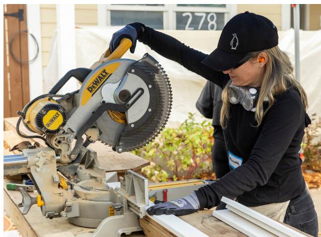
Volunteer cuts baseboard

Habitat for Humanity Vail Valley | 970.748.6718 Construction | 970.748.6718 ext. 305 Habitat ReStore | 970.328.1119 construction@habitatvailvalley.org