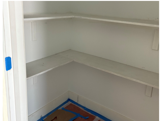
Trim installed in BLDG 14 pantry