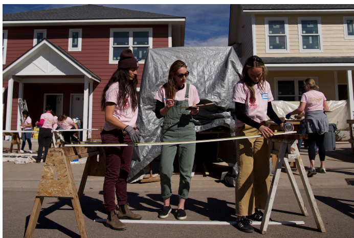
Volunteers measure and mark trim