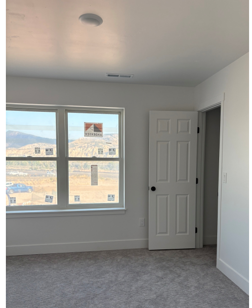
Carpet installed in BLDG 17

Eight of our homes are nearly ready for homeowners after lots of progress was made in July! All of our painting and finish carpentry was completed with the help of many volunteer groups and partner families. Now, all that's left are finishing touches such as blinds, bathroom hardware, and countertops. We plan to have all of these families move in during the month of August. After that, our team can concentrate on the eight remaining units in Phase 11 that are in the rough-in stage of construction.