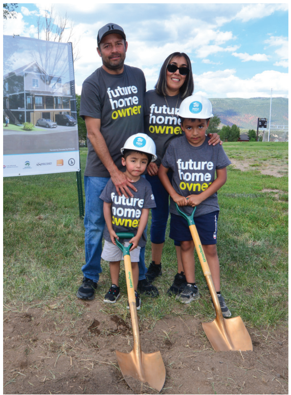
We broke ground on 16 modular homes in June 2023.

In 2023, revenue was nearly $11.5M, the most in our 29-year history. Of note, Habitat Vail Valley received almost $6.7M in grants, including three new and significant awards via the American Rescue Plan Act. As a result, a sizeable net income was realized and, in large part, dedicated to the upcoming 16-home modular project in Eagle. At year end, Habitat Vail Valley is well positioned, as this form of construction requires an accelerated cash flow. Our programs continue to expand across advocacy, construction, family services and ReStore. Lastly, fundraising and management expenses are 12% and 7%, respectively.