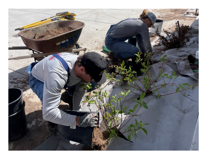
Volunteers from Breck Grand Vacation install shrubs donated from Plantivity