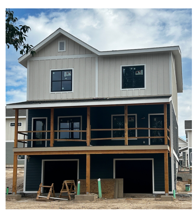
The houses are looking like homes

and will be ready for families this summer!