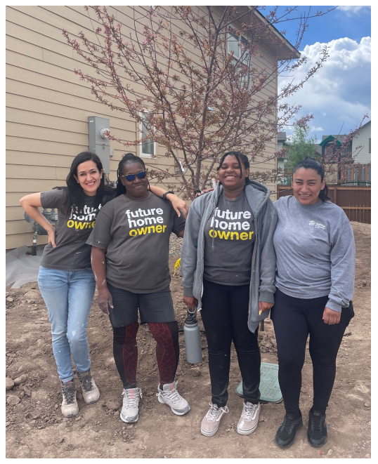
Phase 9 Future Homeowners pose in front of one of Plantivity's beautiful trees

The team has also been working hard to make the exteriors of the home as beautiful as the interiors. This month, Plantivity donated all of the trees and shrubs for the project and they were installed by hard working volunteers. Plantivity has been a generous partner in Habitat Vail Valley's mission for over a decade, donating over 100 trees and 300 shrubs to the Stratton Flats and Grace Avenue projects. Sod was installed delivered and from Distribution with a very generous donation as well. We are so thankful for our partners Plantivity and Rivendell Distribution for helping make our exteriors beautiful and keep our costs down! We are excited to finish landscaping in time for summer in Gypsum!