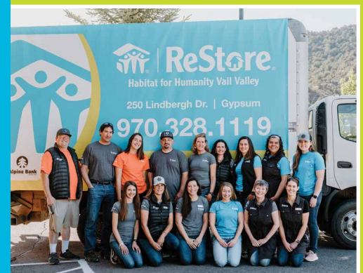
Habitat for Humanity Vail Valley staff at the Grand Opening of the Habitat ReStore in Gypsum.