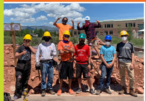
Beck Building employees volunteered during the pandemic.

“Homes, Communities, Hope + You” has never rang truer. We appreciate your unwavering support as you have helped us persevere and build a loving community for the families we serve.